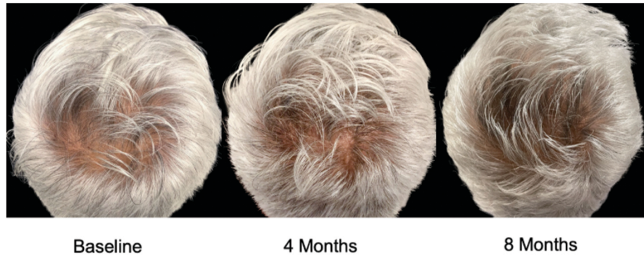
Figure 2. Trichoscans showing hair growth at 4 and 8 months following use of REVIVV(tm) topical serum twice daily.